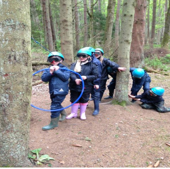
P7 Residential Trip, Liverpool